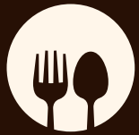
Large scale dining spaces