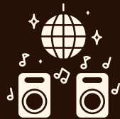
Live entertainment venues