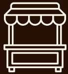
Food Halls & Market Concepts