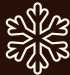
Winter & Festive Experiences